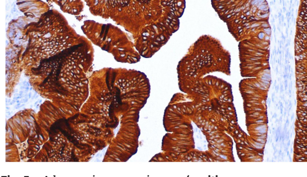
Fig. 5 – Adenocarcinoma mucinosum (positive immunohistochemical staining for CK20, original magnification × 200).