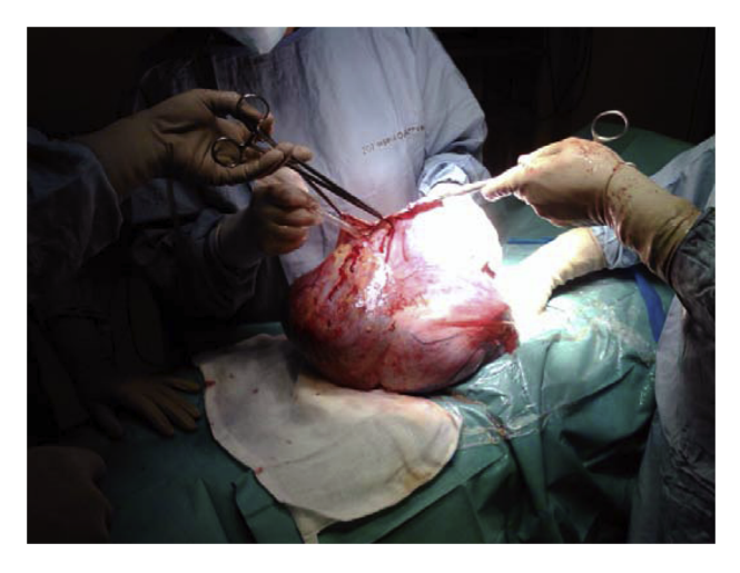
Fig. 2 - Tumor of the left ovary inrtaoperatively.