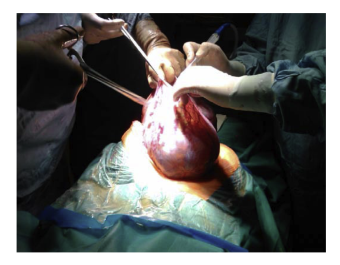
Fig. 3 - Tumor of the left ovary inrtaoperatively.

The postoperative course was uneventful. Histological results of postoperative specimen confirmed Adenocarcinoma metastaticum et intestino crasso. Tumor markers: CK7(–), CA125(–), CK20(+++), CDX2(+++) Mucicarmine( \pm ).